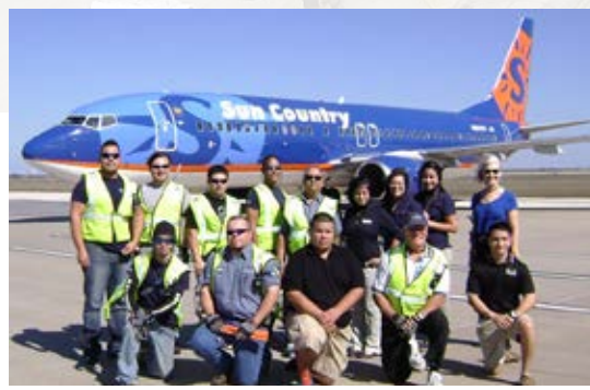
VIA Ground Handling

THE RIO GRANDE VALLEY VIA is just 10 miles north of the U.S. - Mexico border, strategically located within a population center of 1.1 million people in the RGV and 2.2 million in Northern Mexico. The region enjoys great weather year round and is home to one of the best vacation spots in the nation, South Padre Island.