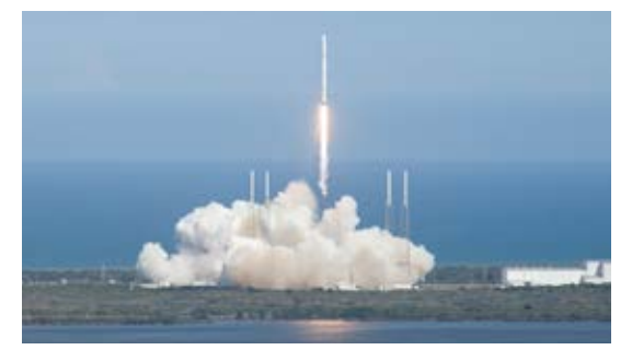
Coming Soon SpaceX Launch Site